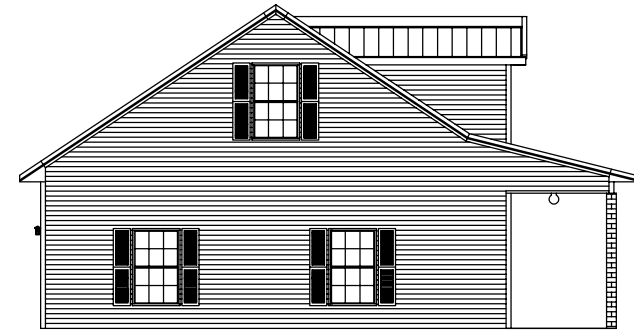
LEFT ENDWALL ELEVATION