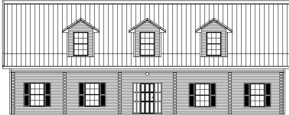
FRONT SIDEWALL ELEVATION