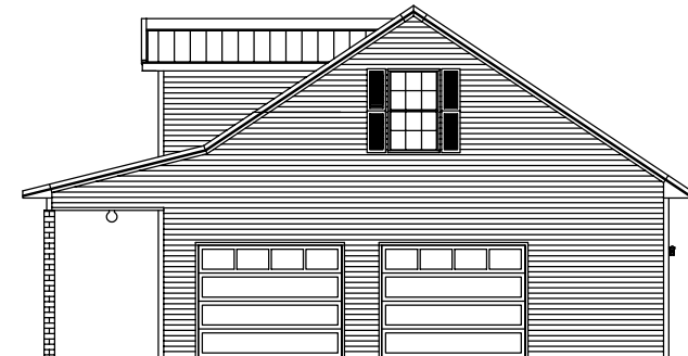
RIGHT ENDWALL ELEVATION