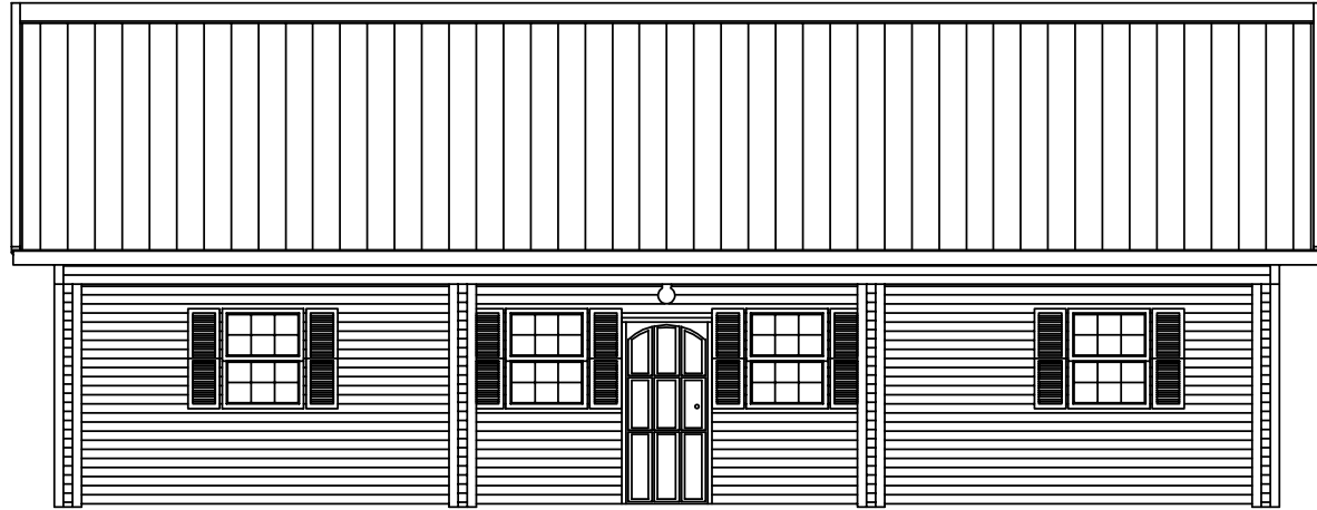
FRONT SIDEWALL ELEVATION