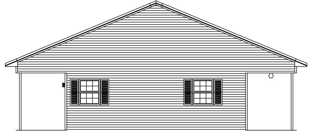
LEFT ENDWALL ELEVATION