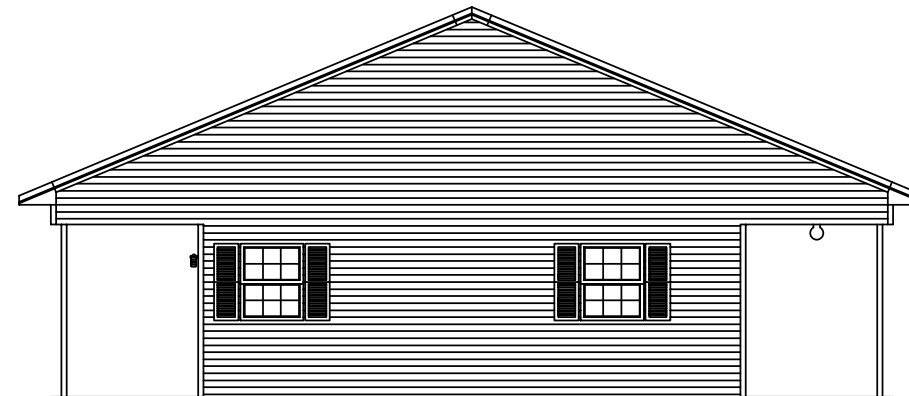
LEFT ENDWALL ELEVATION