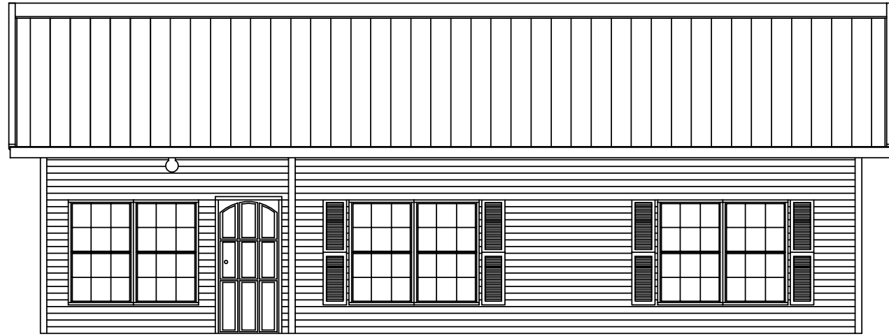
FRONT SIDEWALL ELEVATION