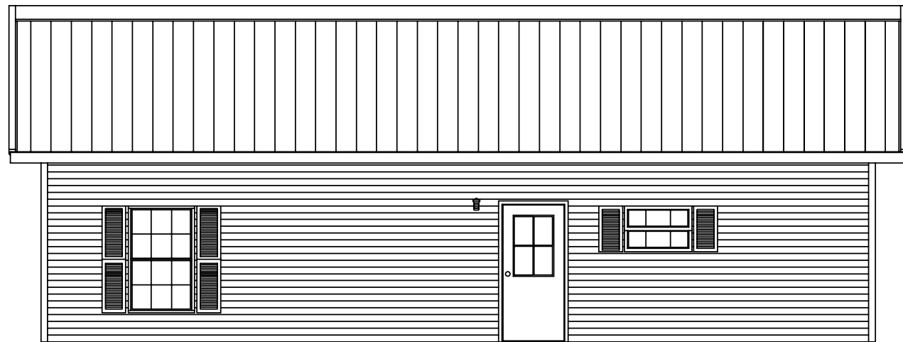
BACK SIDEWALL ELEVATION