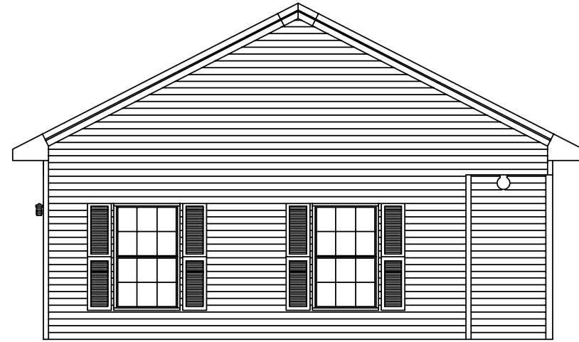
LEFT EDWALL ELEVATION