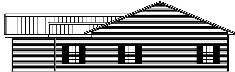
RIGHT ENDWALL ELEVATION