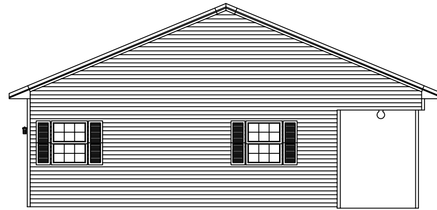
LEFT EDWALL ELEVATION